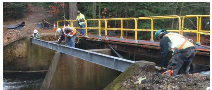
TANTARA employees performing repair work on the Patterndam Bridge in Holland, MA.